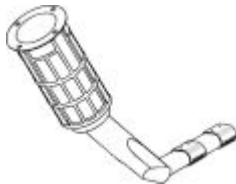
Short Combiwedge 100.517: Short Combiwedge, 50 mm with test channel 100.518: Short Combiwedge, 50 mm without test channel