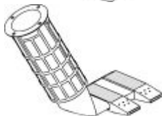
Long Combiwedge 100.525: Long Combiwedge, 50 mm with test channel 100.526: Long Combiwedge, 50 mm, without test channel